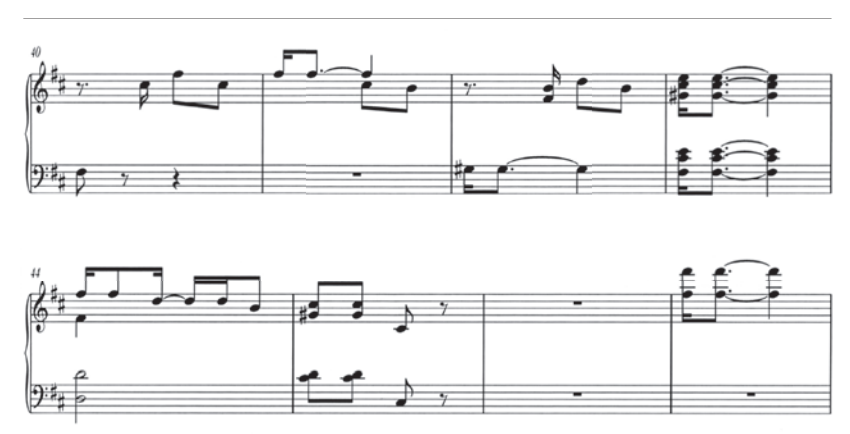
FIGURE 1 Kwabena Nketia, "Builsa Work Song", bars 40-54 (Nyaho, 2009, p. 29)

Nyaho's anthology includes two of Nketia's compositions. One, "Builsa Work Song," composed in 1968, is a charming "recreation" (the composer's word) of an indigenous work song from among the Builsa people. The other is "Volta Fantasy," a bold work in the key of A minor that makes central use of the standard pattern in an otherwise fragmented texture. "Builsa Work Song" begins with a snappy iambic rhythm that, together with its long-short retrograde companion, generates a dance groove through repetition. The large-scale form consists of a three-fold presentation of the main tune framed by an exclamatory beginning that returns as an ending (Figure 1).