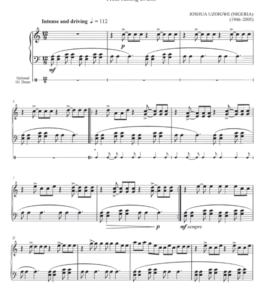
47. Ukom From Talking Drums

The composition's generative rhythm is a restless iambic figure that contributes considerable momentum. Something of a dance feel is heard throughout, but the composer's voice is never far away.