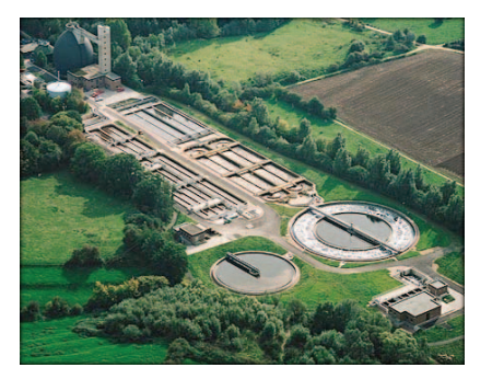
Figure 2. Two different images to illustrate the concept "water pollution".

In the context of text analysis prior to translation, it is therefore important to include image analysis as an important issue regarding the adequacy of an image in terms of catalyser of the function and focus of a particular text. Furthermore, as the eye meets the visual information before the textual one, processing information through graphic input might well condition the later understanding of the information contained in the text. As Lee-Jahnke (2005: 363) puts it for the case of mental representations: