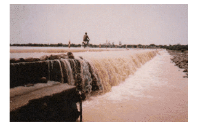
Figure 4. Image extracted from the Puertoterm image bank to illustrate the "concept flood".

Since there is evidence that situated simulation (Barsalou 2003) is a powerful interface between perception and cognition, we believe that just as the development of process-oriented terminology banks (Faber et al, in this volume) should include contextually-relevant properties of the focal category, the image should also bear a close relation to the focal categories. For example, when searching for the lexical item flood in our corpus, the word is usually accompanied by information regarding the consequences of floods for human populations. It is quite likely that the images accompanying these texts use human features to illustrate the concept, such as those in figure 4.