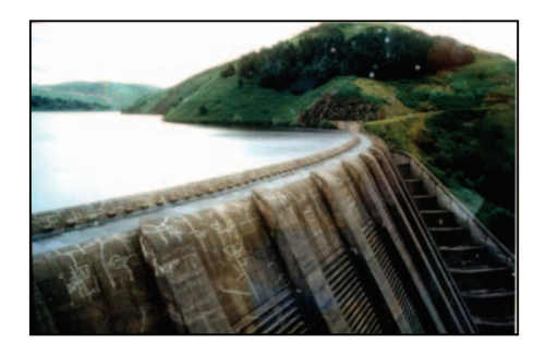
Figure 1. Examples of an inadequate image to illustrate a concept (left) and an adequate one (right) on the grounds of prototypicality.