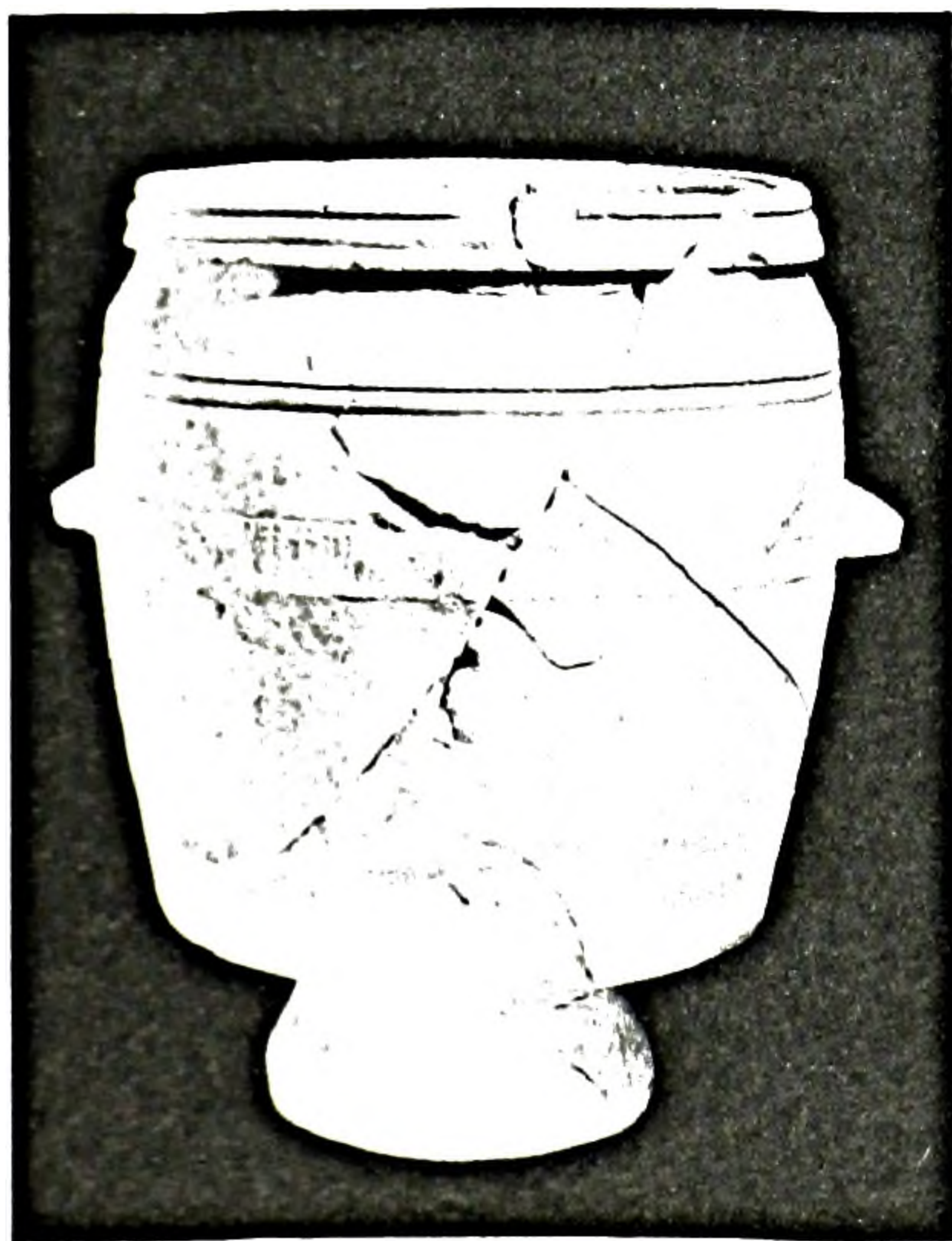
FIGURE 1. Stone vessel. Yadin, p. 48.

The Islamic Garden offers the student of garden history, and of Islamic culture, significant rewards. Not the least of these is Richard Ettinghausen's cogent justification of a selective cross-cultural, rather than strictly regional, presentation of the subject. Like Islam itself, the Islamic garden exists as a nexus of attitudes and responses which have been translated into the visual languages of societies as diverse politically, and as distant physically, as Umayyad Spain and Safavid Iran. But while cultural idioms may have varied, basic expressive relationships – the relationship of artificial to 'natural,' of garden setting to architectural focus, of walled to non-walled areas – demonstrate a binding continuity over space and time. The streams that nourished the Islamic garden flowed out from a single, central source, as Ettinghausen suggests. The fact that the five essays which follow the introduction elaborate specific aspects of this perceptive text imposes upon the collection a thematic structure