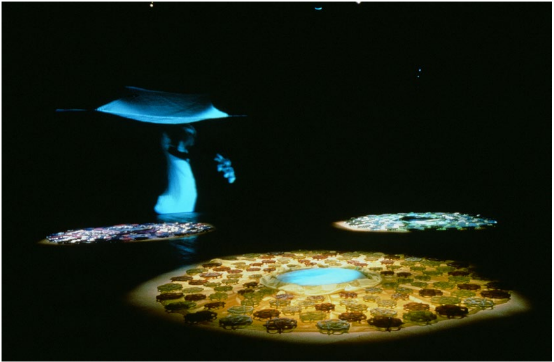
Figure 3. María Magdalena Campos-Pons, Meanwhile the Girls Were Playing , 1999–2000 (installation view). Installation by Campos-Pons and sound by Neil Leonard. Mixed media installation: metallic organdy, silk, embroidered fabric, pâte de verre flowers, four projected video tracts, stereo sound. Dimensions variable.