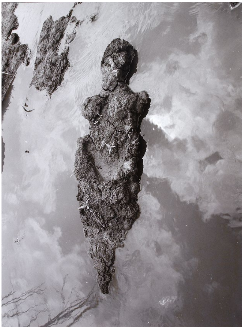
Figure 4. Ana Mendieta, Isla , 1981. © 2022 The Estate of Ana Mendieta Collection, LLC. Courtesy Galerie Lelong & Co. / Licensed by Artists Rights Society (ARS), New York.