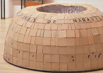
Figure 2. María Magdalena Campos-Pons, History of a People Who Were Not Heroes: A Town Portrait , 1993. Installation by Campos-Pons and sound by Neil Leonard. Mixed media installation: wood, glass steel, clay tablets, black and white photographs, 3 channel video, stereo sound. Dimensions variable.