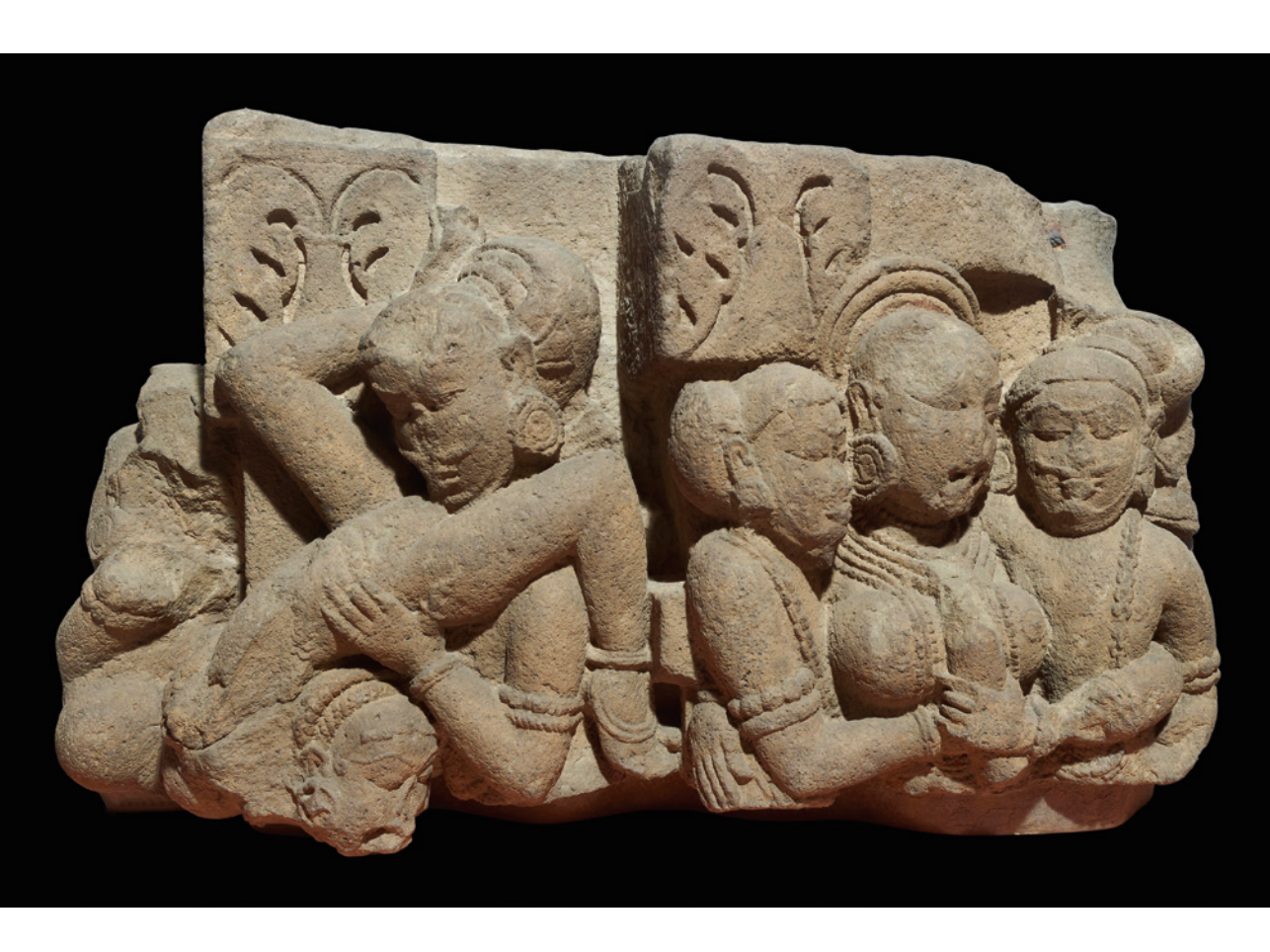
Fig. 1 Sandstone Architectural Fragment, 11th century, South Asia, probably western India.