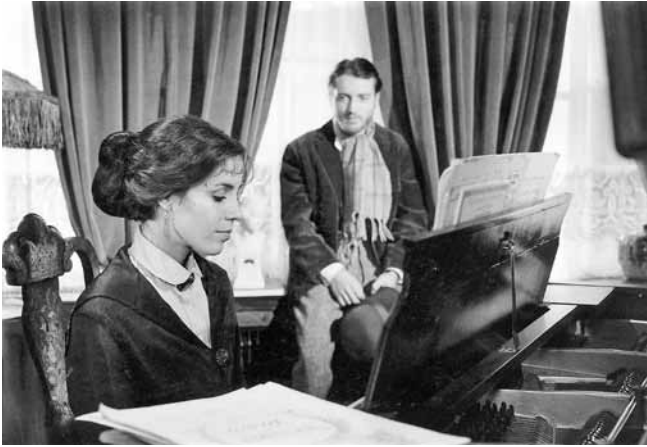
Figure 3. Joyce Wieland, The Far Shore (Eulalie and Tom), 1976. Film: 106 minutes, colour, sound, 35mm.

ization of Tom and to his identification as Indian-like. This first scene with Tom is important for several reasons: his character enters the film at a moment when the viewer feels sympathy for Eulalie, who has just been alienated by Ross's "foreigner" remark. In addition, Eulalie's acceptance of his Indian tea, despite, and perhaps because of, Ross's rejection of it, is a gesture that indicates to viewers that she has an ally in Tom, beginning an emotional and intimate connection between the two that develops throughout the film.