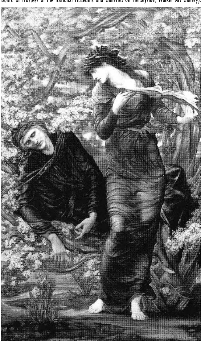
Figure 4. Edward Burne-Jones, The Beguiling of Merlin, 1874, oil on canvas.

loss would have been reason enough for her contemplation of the connections between women, children and death.