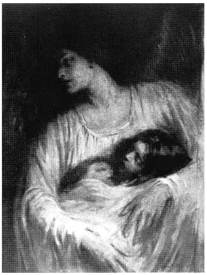
Figure 5. Laura Muntz, Protection , before 1911, watercolour on paper. Location unknown (Reproduced from The Canadian Magazine , XXXVII, 5 (September 1911), 426).

tural model of protection, it also contains the potential for destruction.<sup>40</sup> In Madonna and Child the mother is also the personification of death and, as such, can be seen as the Symbolist vampiric femme fatale.