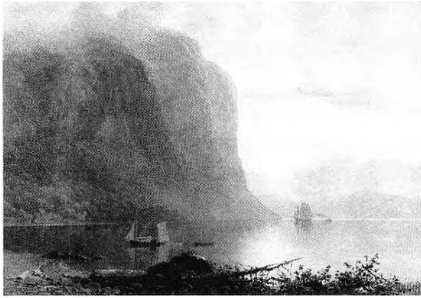
FIGURE 88. Lucius O'Brien, Sunrise on the Saguenay , 1880. Oil on canvas, 87.7 × 128.8 cm. National Gallery of Canada, Ottawa.