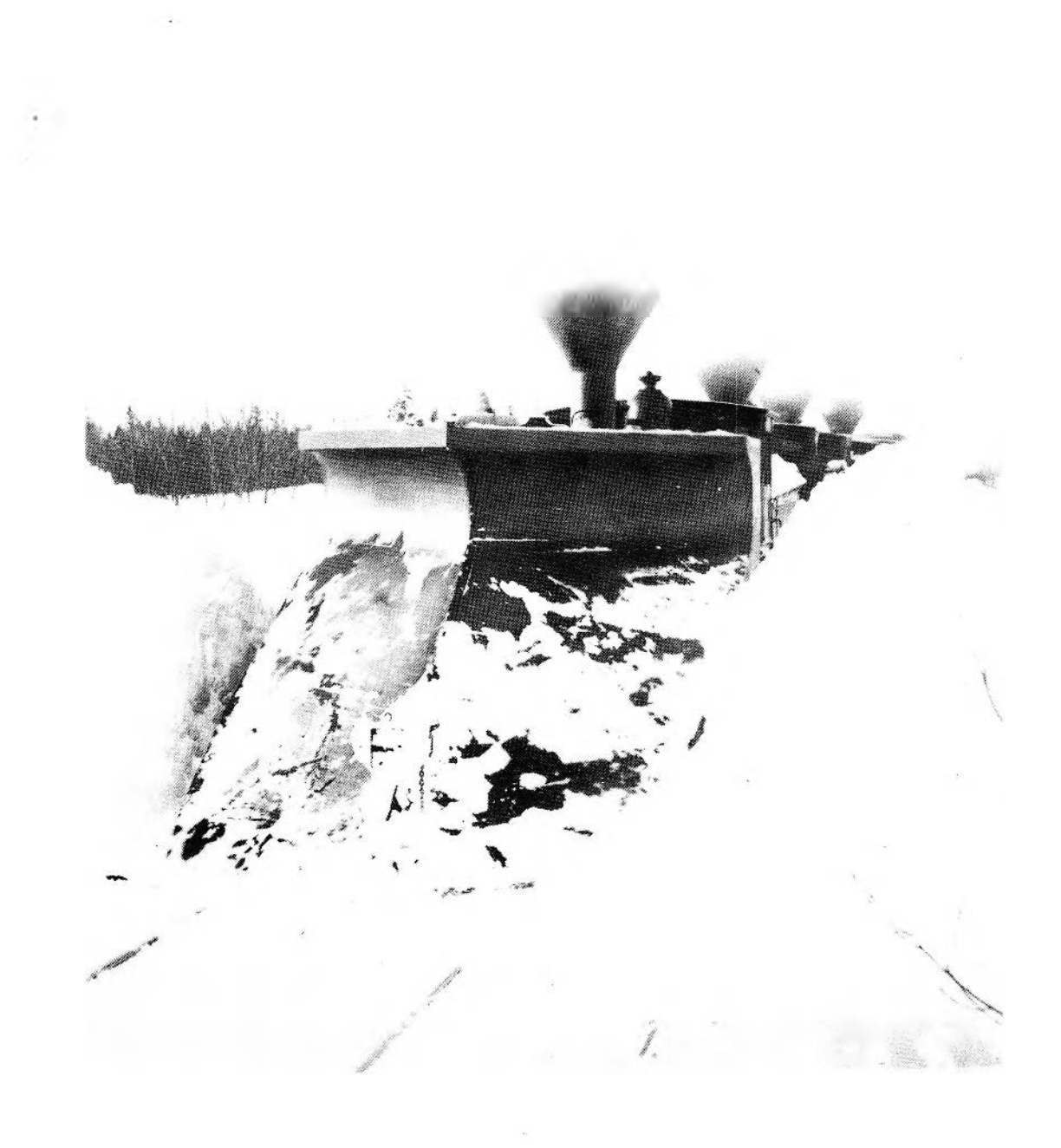
FIGURE 174. Alexander Henderson, Press Castle, Scotland, 1831-Montréal, 1913, Active, Canada, Engines clearing the track, G.T.R., albumen silver print from wet-collodion glass-plate negative, 1869, 11.2 × 8.9 cm, plate 1 from Snow and Flood After Great Storms of 1869 (Montreal: Alexander Henderson, 1869). PH1981:1285:001, Collection Centre Canadien d'Architecture/Canadian Centre for Architecture, Montréal.