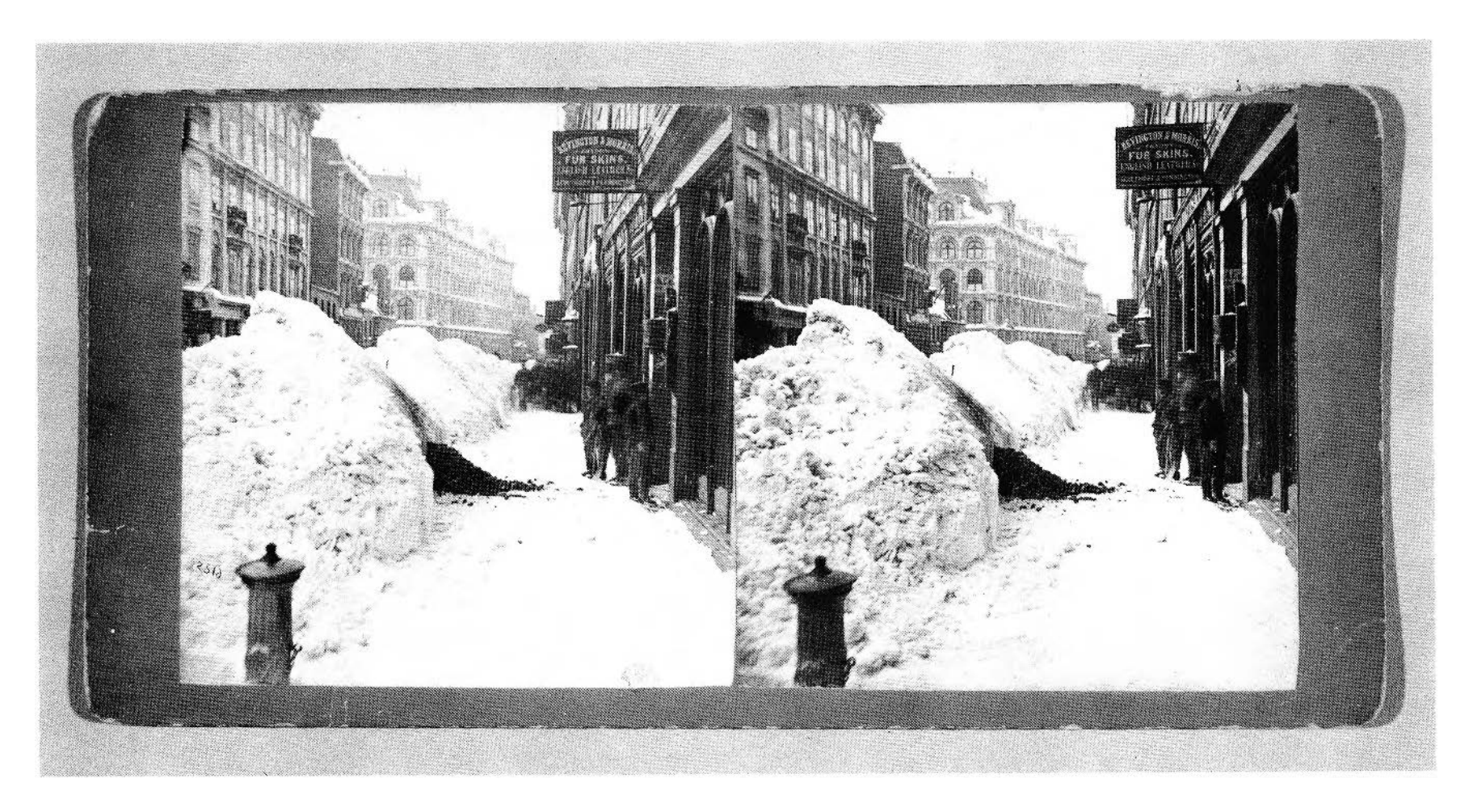
FIGURE 179. Alexander Henderson, Press Castle, Scotland, 1831-Montréal, 1913, Active, Canada, St. James Street, Montreal , stereograph (two albumen silver prints from wet-collodion glass-plate negative), March 1869, 7.9 × 7.5 cm (each image). Collection David Miller, Montréal.