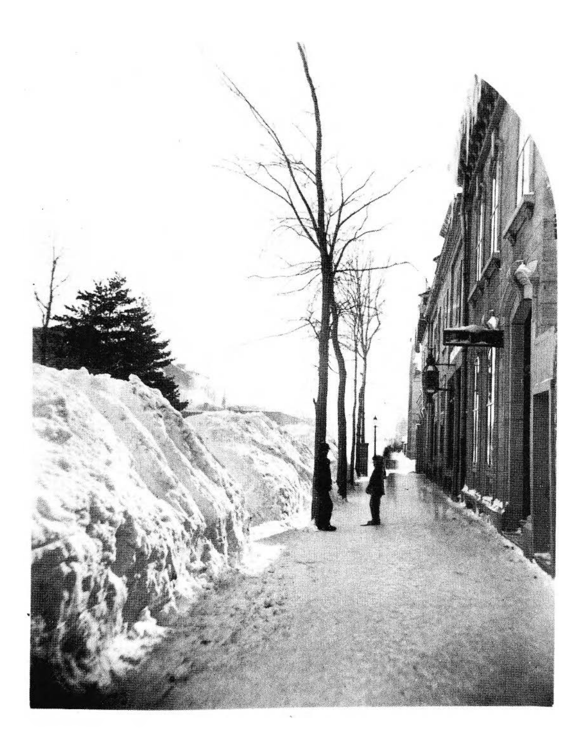
FIGURE 176. Alexander Henderson, Press Castle, Scotland, 1831-Montréal, 1913, Active, Canada, Phillips Square , Montreal , albumen silver print from wet-collodion glass-plate negative, March 1869, 11.3 × 8.9 cm, plate 7 from Snow and Flood After Great Storms of 1869 (Montreal: Alexander Henderson, 1869). PH1981:1285:007, Collection Centre Canadien d'Architecture/Canadian Centre for Architecture, Montréal.