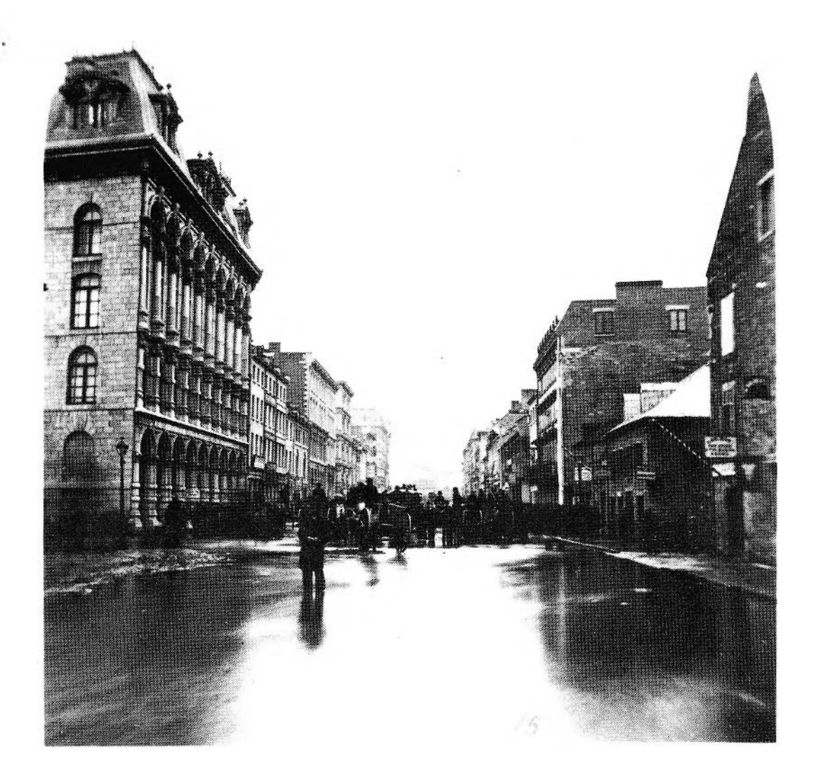
FIGURE 177. Alexander Henderson, Press Castle, Scotland, 1831-Montréal, 1913, Active, Canada, Spring Flood in McGill Street, Montreal, albumen silver print from wet-collodion glass-plate negative, April 1869, 10.1 × 8.9 cm, plate 15 from Snow and Flood After Great Storms of 1869 (Montreal: Alexander Henderson, 1869). PH1981:1285:015, Collection Centre Canadien d'Architecture/Canadian Centre for Architecture, Montréal.