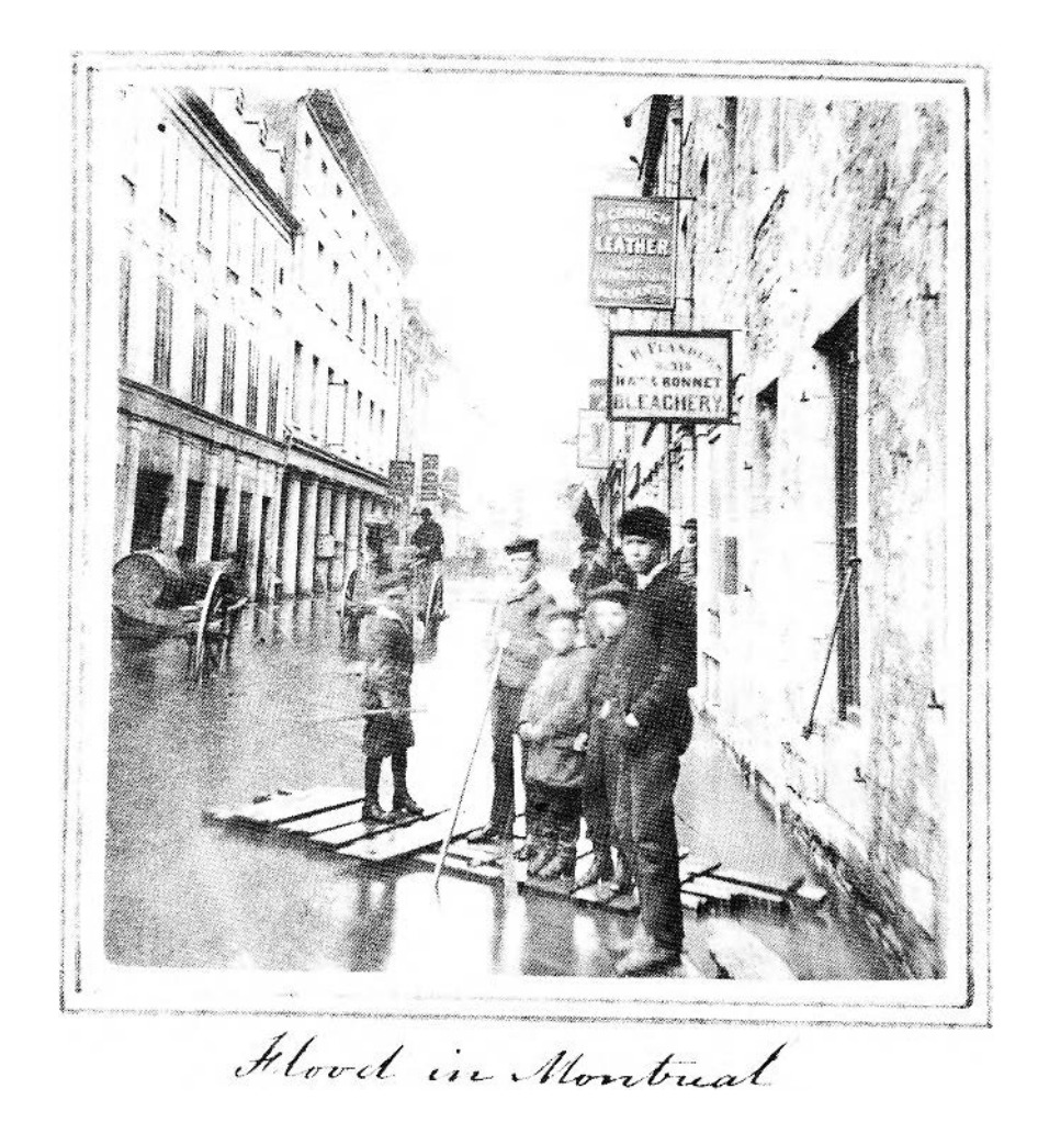
FIGURE 182. Alexander Henderson, Press Castle, Scotland, 1831-Montréal, 1913, Active, Canada, Flood in Montreal (St. Paul Street) , albumen silver print from wet-collodion glass-plate negative, April 1869, 7.7 × 7.3 cm, unnumbered plate in an album owned by General Thomas J. Grant.