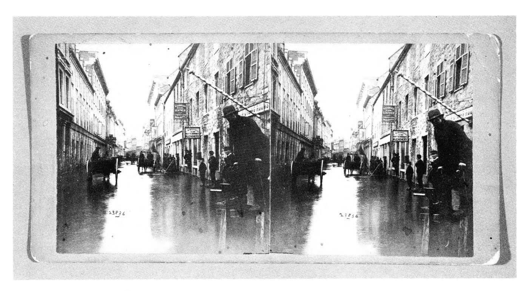
FIGURE 184. James Inglis, Scotland, 1835-Chicago, 1904, Active, Canada and the United States, St. Paul Street, Montreal , stereograph (two albumen silver prints from a wet-collodion glass-plate negative), 22 April 1869, 7.7 × 7.9 cm (each image). SV1978:0010, Collection Centre Canadien d'Architecture/Canadian Centre for Architecture, Montréal.