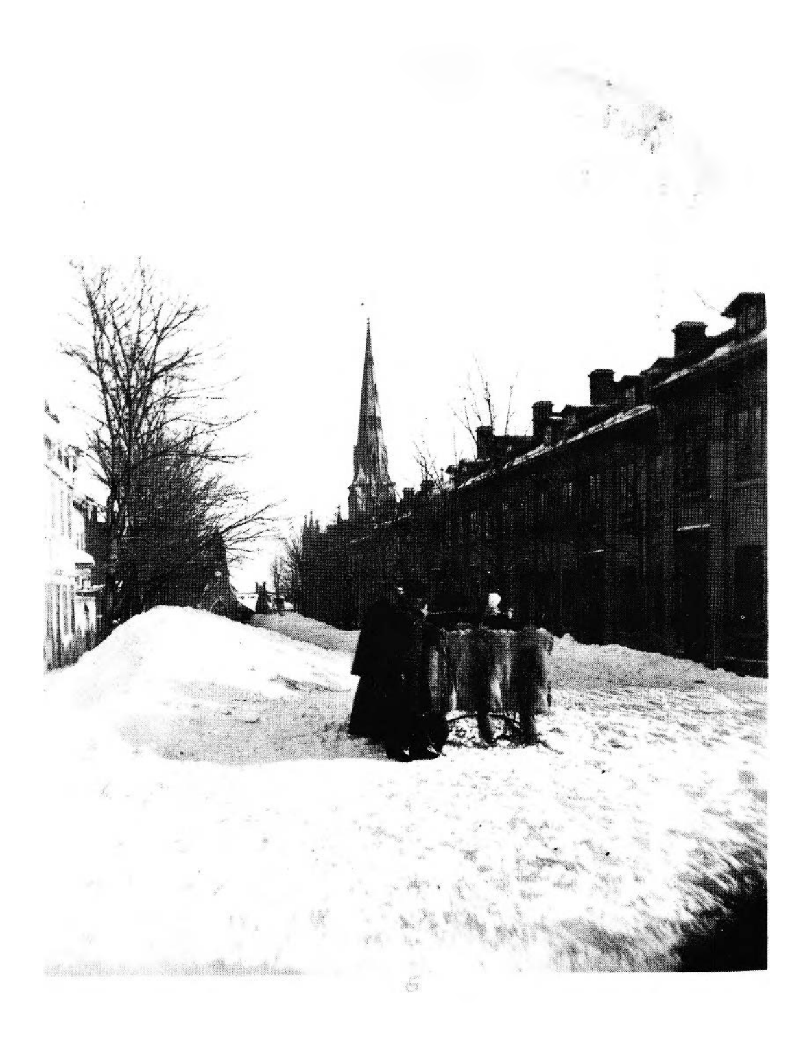
FIGURE 175. Alexander Henderson, Press Castle, Scotland, 1831-Montréal, 1913, Active, Canada, Beaver Hall, Montreal , albumen silver print from wet-collodion glass-plate negative, March 1869, 11.2 × 8.9 cm, plate 6 from Snow and Flood After Great Storms of 1869 (Montreal: Alexander Henderson, 1869). PH1981:1285:006, Collection Centre Canadien d'Architecture/Canadian Centre for Architecture, Montréal.