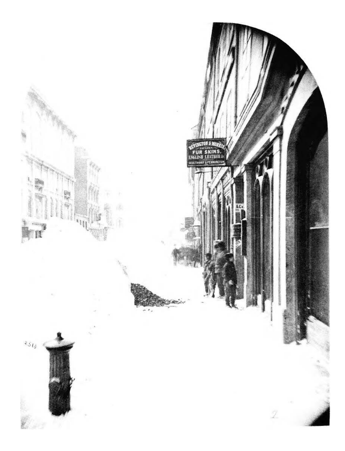
FIGURE 178. Alexander Henderson, Press Castle, Scotland, 1831-Montréal, 1913, Active, Canada, Great St. James Street, Montreal , albumen silver print from wet-collodion glass-plate negative, March 1869, 11.7 × 8.9 cm, plate 2 from Snow and Flood After Great Storms of 1869 (Montreal: Alexander Henderson, 1869). PH1981:1285:002, Collection Centre Canadian d'Architecture/Canadian Centre for Architecture, Montréal.