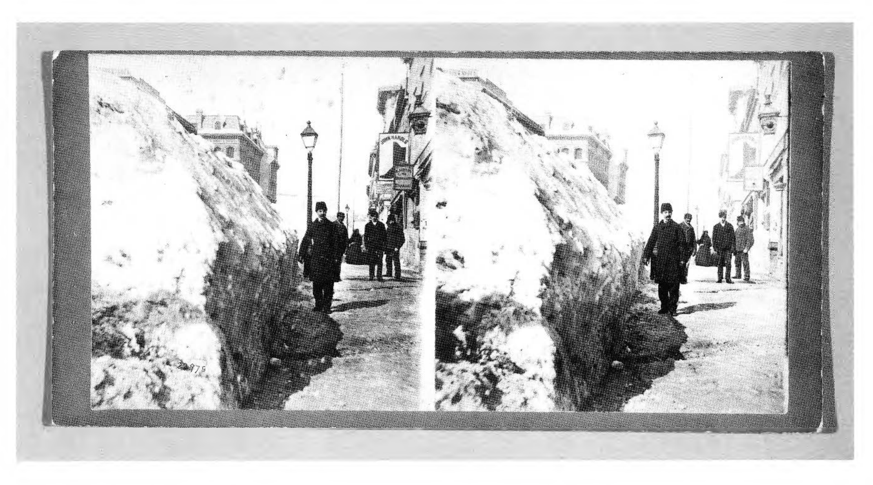
FIGURE 181. James Inglis, Scotland, 1835-Chicago, 1904, Active, Canada and the United States, McGill Street , Montreal , stereograph (two albumen silver prints from a wet-collodion glass-plate negative), March 1869, 7.8 × 7.7 cm (each image).