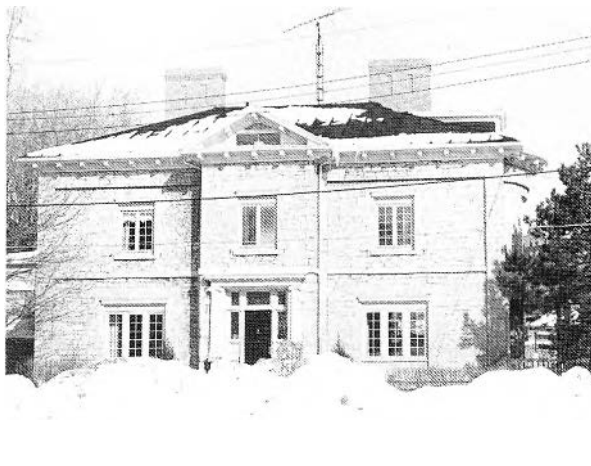
FIGURE 91. John Power, 5 Emily Street, 1854, Kingston.