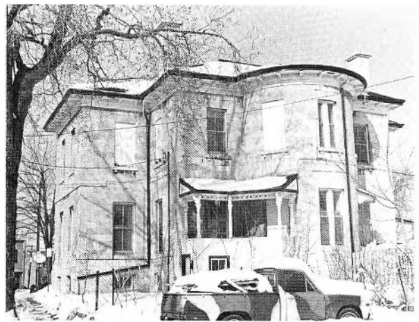
FIGURE 92. John Power, south façade of The Folly, 1860-62, 329 Division Street, Kingston.