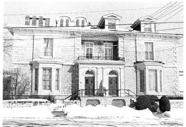
FIGURE 90. William Coverdale, Edgewater, 1858, 1-3 Emily Street, Kingston.