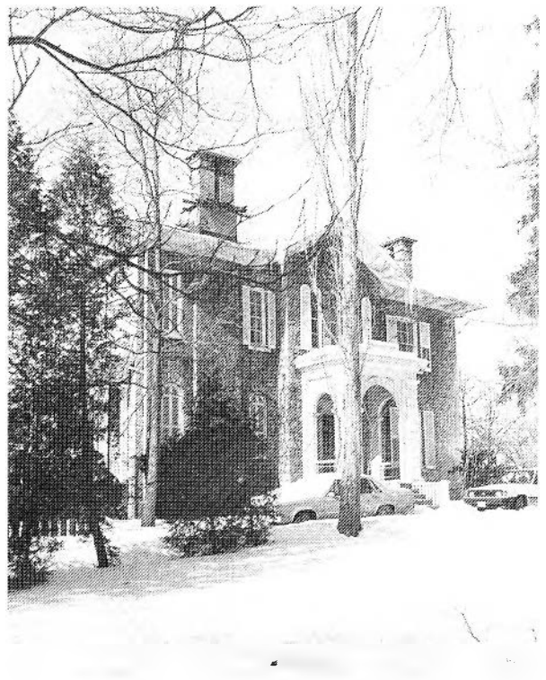
FIGURE 97. William Coverdale, Elmhurst, 1852, 26 Centre Street, Kingston.