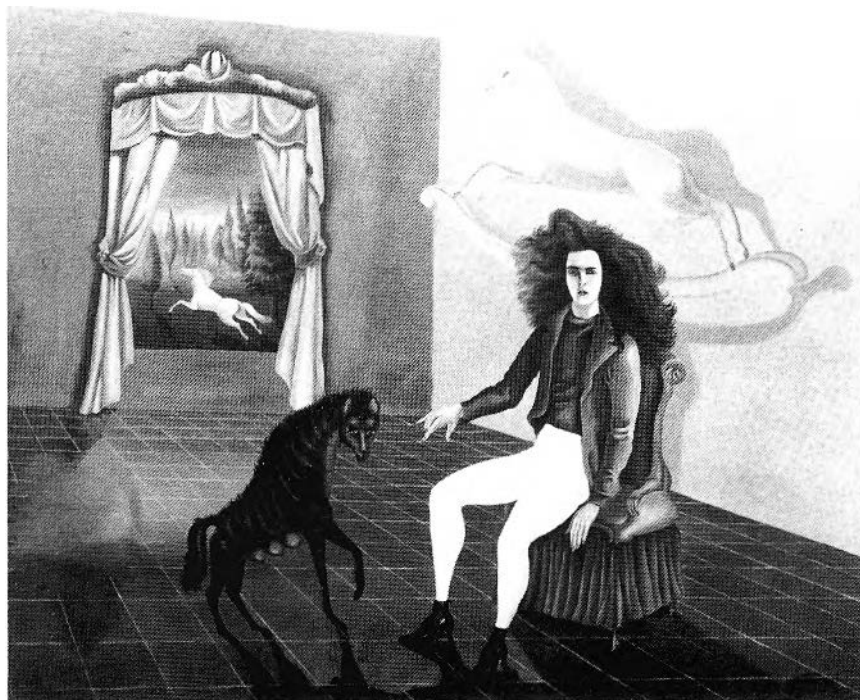
FIGURE 98. Leonora Carrington, Self Portrait , 1937 (Photo: Courtesy of Pierre Matisse Gallery, New York).