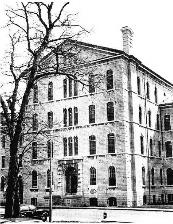
FIGURE 96. William Coverdale, centre pavilion of the Lunatic Asylum, begun 1859, King Street West, Kingston.