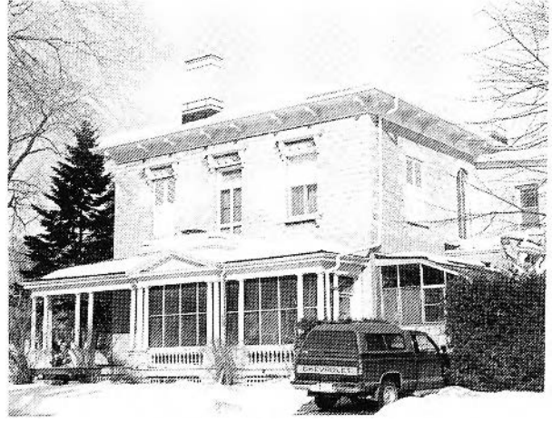
FIGURE 94. John Power, west side-view of Parkview House, 1854, 31 King Street West, Kingston.