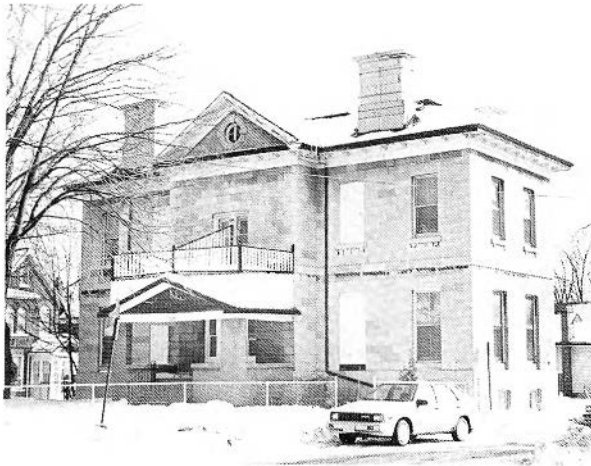
FIGURE 89. John Power, north façade of The Folly, 1860-62, 329 Division Street, Kingston.