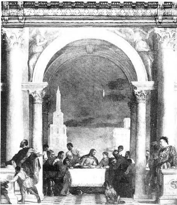
FIGURE 87. Paolo Veronese, The Feast in the House of Levi , detail of the central section.