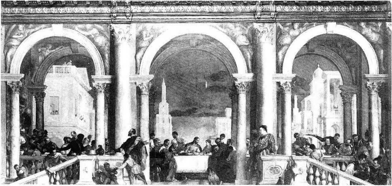
FIGURE 86. Paolo Veronese, The Feast in the House of Levi , 1573. Venice, Galleria dell'Accademia (Photo: Archivio Fotografico della Soprintendenza ai Beni Artistici e Storici di Venezia).