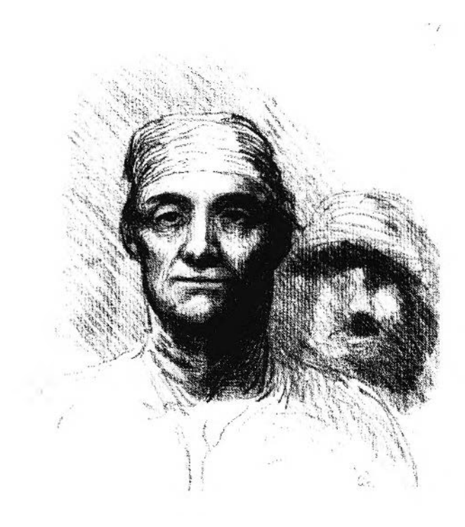
FIGURE 98. Daumier, Two heads of men , 1840s(3). Black chalk, 16.7 \times 15 cm., Museum Boymans-van Beuningen, Rotterdam.