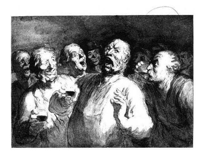
FIGURE 106. Daumier, La chanson à boire , ca. 1860-65. Black chalk, pen and ink and watercolours, 26 \times 34 cm., location unknown.