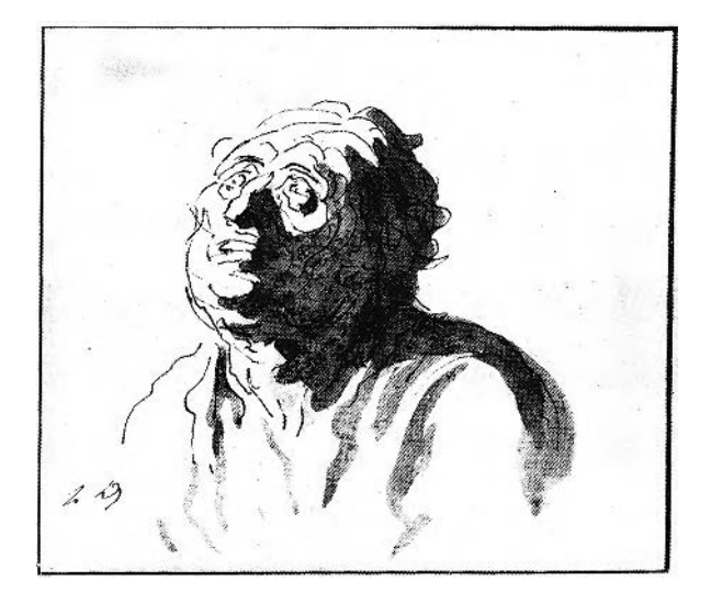
FIGURE 108. Daumier, Head of a man, ca. 1870. Pen and wash, 10 \times 11.5 cm., London, Mr. F. M. Gross.