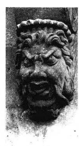
FIGURE 107. Antoine Barye, Mascaron , ca. 1851. Paris, Pont-Neuf.