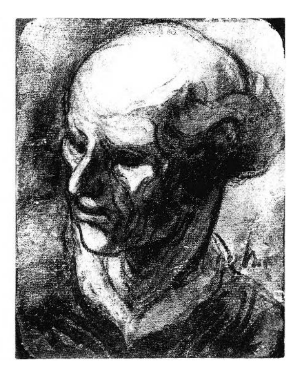
FIGURE 99. Daumier, Study of a Man's Head , ca. 1848-59. Black chalk, charcoal, brush and wash, varnished, laid on board, 23 \times 18 cm., private collection.