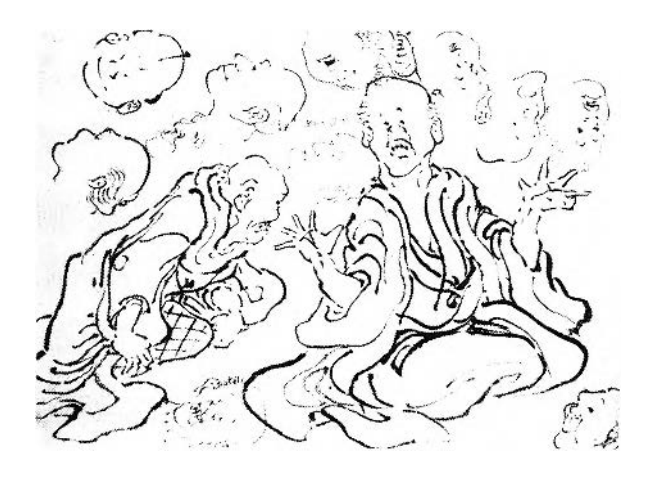
FIGURE 109. Katsushika Hokusai. Page of miscellaneous figures, Edo period, ca. 1830. Black ink (brush) on paper, Washington, D.C., Freer Gallery.