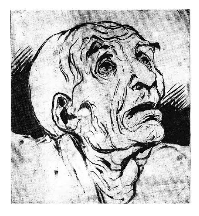
FIGURE 95. Daumier, Tête d'expression, ca. 1849-51. Brush and brown ink, 35 \times 32.5 cm., London, British Museum.