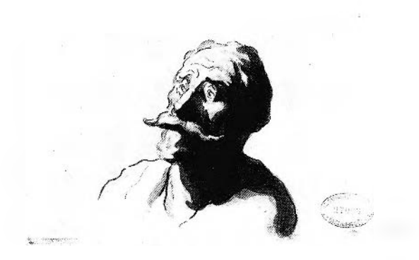
FIGURE 111. Daumier, Head of a man , ca. 1860-69. Black chalk and watercolour washes, 13.8 \times 24 cm., Paris, Ecole Nationale Supérieure des Beaux-Arts.