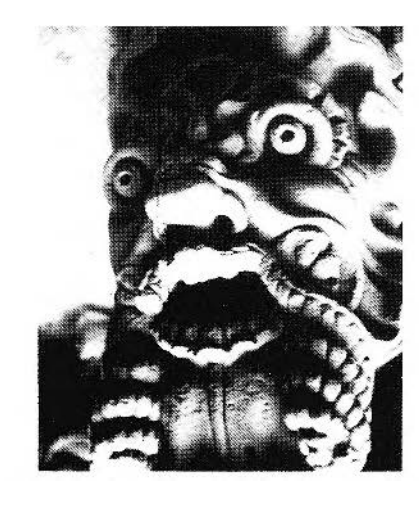
FIGURE 105. Anonymous French, Mascaron , ca. 1610. Paris, Musée de Cluny (formerly on the Pont-Neuf).