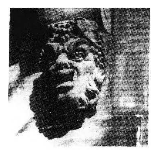
FIGURE 104. Antoine Barye, Mascaron (Silenus), ca. 1851. Pont-Neuf, Paris.