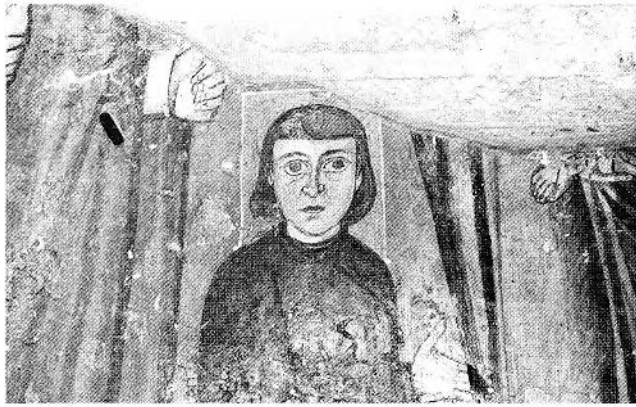
FIGURE 3. Family of Theodotus, detail. Rome, Theodotus chapel, S. Maria Antiqua, 741-752 A.D. Krautheimer, pl. 85 (Photo: J. Osborne).

Trastevere), and the 'disabitato,' the large stretches of land inside the Aurelian walls which lay abandoned or were used for crops or pasture. An entire chapter is devoted to the one mediaeval addition to the physical area occupied by the city: the Borgo. It is in some respects comforting to learn that the plethora of tourist stalls in the streets around St. Peter's were if anything more profuse in the thirteenth century than they are today.