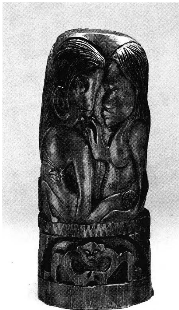
FIGURE 1. Paul Gauguin, Hina and Te Fatou, 1892 (cat. 12). Tamanu wood, h. 32.7 cm. The Art Gallery of Ontario.