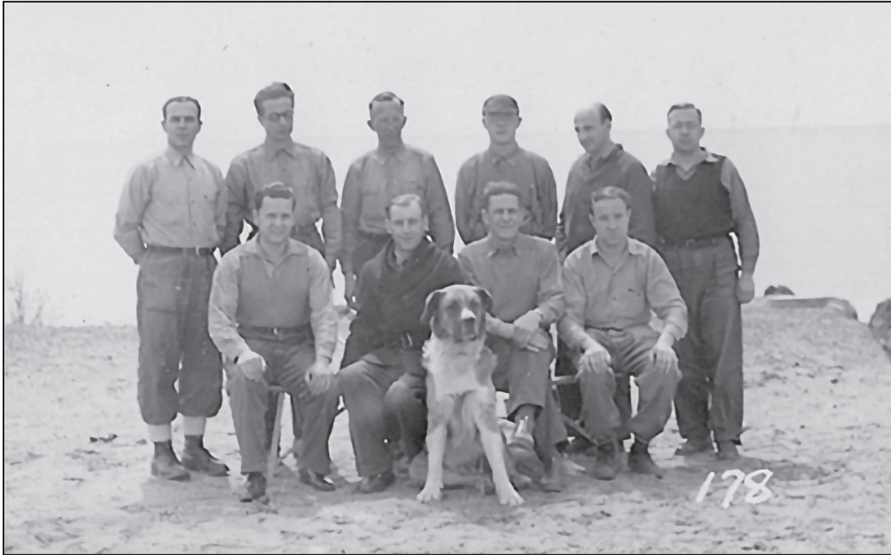
German civilian internees and EMS at Camp 100 in 1942, with Lake Superior in the background.