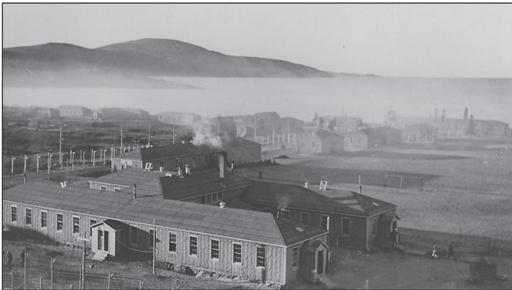
Taken from the guard post atop the water tower, this photo shows Camp 100 with the kitchen and mess hall in the foreground. Although this was taken in 1942, the camp would have appeared much the same in 1944. Note the soccer nets up in the sports field.