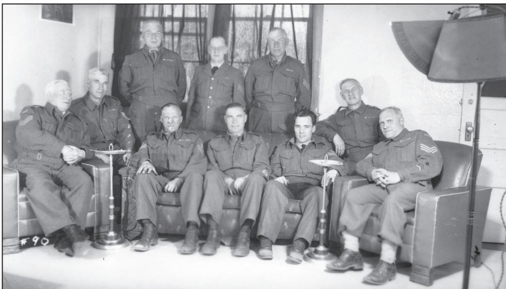
Members of the Veterans Guard of Canada who staffed Camp 100 at Neys. These were First World War veterans deemed too old to serve overseas but still able to render valuable service on the home front. Thunder Bay Historical Museum Society, 974.2.4g.

confined to holding civilian internees and a small number of German Enemy Merchant Seamen (EMS). However, in June 1940, Canada accepted a British request to receive combatant POWs and civilian internees from the United Kingdom. Canada now required more internment camps. The Department of National Defence quickly converted existing facilities, like a former sanatorium and abandoned pulp and paper mills, to hold POWs. Camp R at Red Rock, for example, was built on property formerly owned by the Lake Sulphite Pulp and Paper Company and, opening in July 1940,