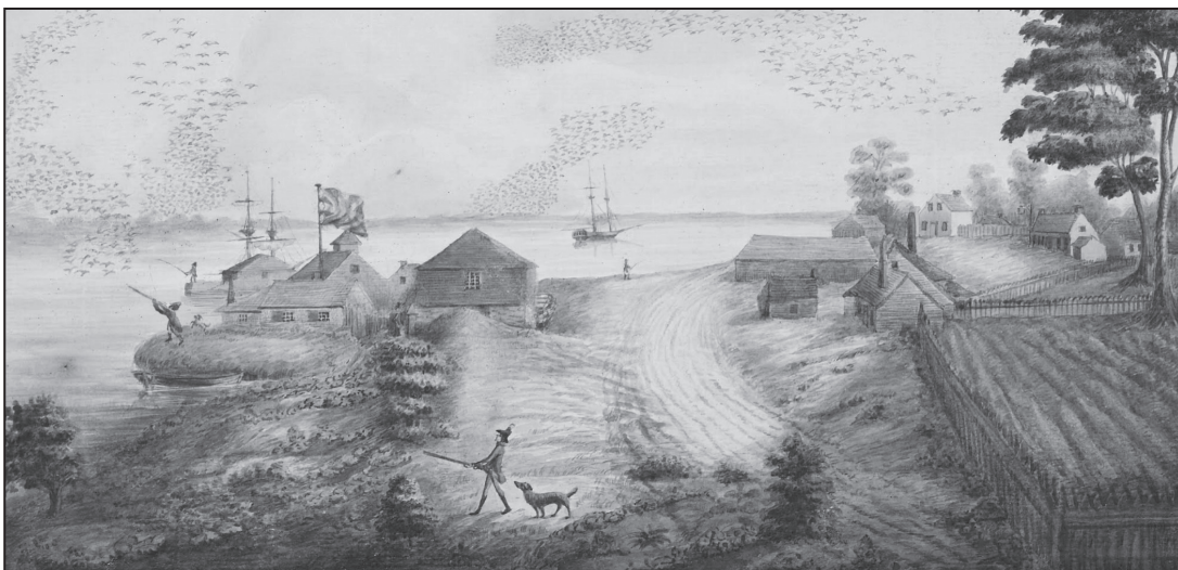
Figure 1: Edward Walsh, Old Fort Erie . Note the officers fishing in the background, the officers shooting in the foreground, and the vegetable garden to the right. (Royal Ontario Museum).

cultivate the necessary vegetables, which by any other means they would not be able to procure.” 27 Similarly, Brock noted how, in 1803, soldiers at Fort George were employed to make a vegetable garden. 28 One osteoarchaeological study reiterates that British soldiers did, in fact, consume vegetables. 29 Vegetables were clearly consumed by British soldiers in Niagara and perhaps beyond, but what they ate specifically is much more un-