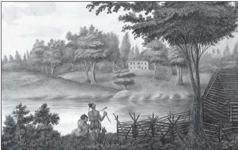
Figure 4: Edward Walsh, The House of Capt. Brant . Here, Joseph Brant hosted British officers to exquisite dinners that deepened social relations between the Haudenosaunee of the Grand River and the British.

Byfield after the disastrous 1813 Battle of the Thames, for example: