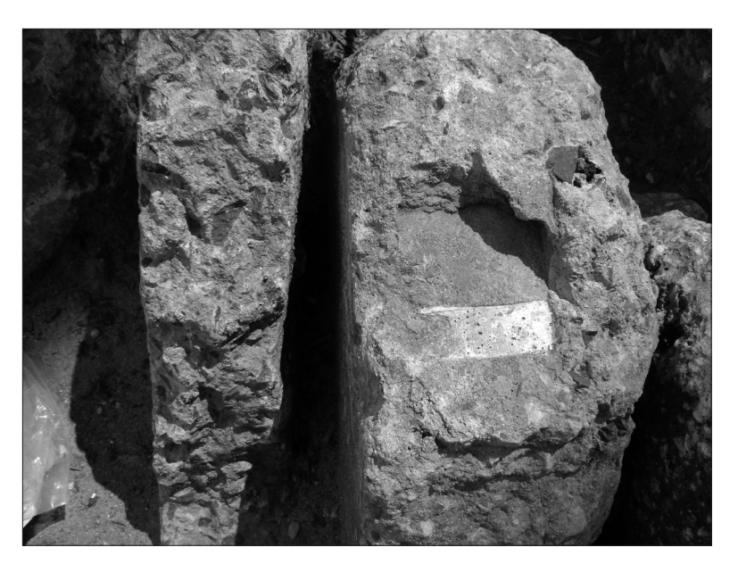
Fig. 10 Mysterious details suggest the past and encourage imaginative narratives.

breakage, and revealed interior aggregates reflect the "opening" of the urban surface. A poetics of concrete, the revealed insides show a pattern of aggregates (gravel) bound together by the once liquid cement mixture. Fluid, then solid, broken, then repurposed—the lifecycle of concrete is long—its durability and reusability carry the potential to be long-lived recording devices.