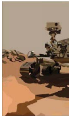
Earth & Planetary Systems

Exploring Geosciences Through Time and Space Explorer les géosciences à travers le temps et l'espace