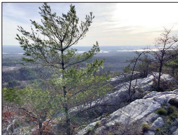
Paleoproterozoic Lorrain quartzite of the Huronian Supergroup, exposure overlooking Whitefish Falls, Ontario.

The rocks of the Paleoproterozoic Huronian Supergroup will be examined at various locations in Ontario. We will view most Huronian sedimentary formations, including: 1) the Matinenda Formation, which hosts the uranium-rich deposits in Elliot Lake, 2) the mudstone-siltstone deposits of the McKim and Gowganda formations in Espanola, 3) the dropstones, varves and other glaciogenic deposits of the Gowganda and Ramsey Lake formations near Iron Bridge, Elliot Lake and Whitefish Falls, 4) the carbonate-rich Espanola Formation in Espanola, 5) the quartz-rich sandstone deposits of the Lorrain, Bar River, and Serpent formations at various localities, and 6) evidence for early life in the Gordon Lake Formation near Flack Lake. Participants will also visit the Sudbury basin, which is host to the Sudbury Igneous Complex, Whitewater Group and Huronian sedimentary rocks containing impact-related structures. A short trip to Manitoulin Island will introduce participants to Ordovician oil shales and fossil-rich carbonate units, as well as the Huronian–Ordovician unconformity.