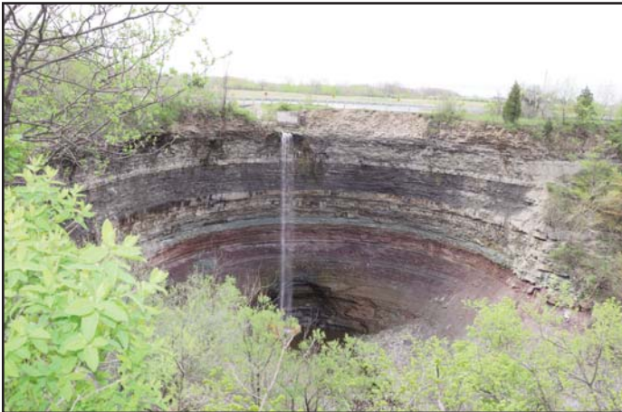
One of the many waterfalls highlighting the sedimentary strata of the Niagara Escarpment.