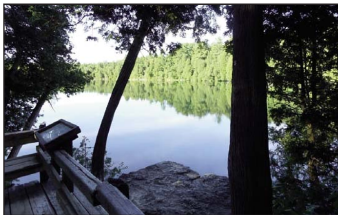
Crawford Lake view from interpretive boardwalk on dolomitic bedrock.

Sediments containing varves accumulate in the deep karstic basin of Crawford Lake on the Niagara Escarpment, allowing changes in water chemistry and the lake ecosystem to be dated with annual resolution. These disturbances were primarily anthropogenic, and archeological evidence of Iroquoian and subsequent Euro-Canadian activities can still be seen in its small watershed. Calcite precipitates in the alkaline waters of the mixolimnion (upper wind-mixed layer) of this permanently stratified lake, forming a summer light-coloured layer, and the dark part of the couplet is organic matter, primarily from mass mortality of plankton after fall turnover. Unlike most meromictic lakes, the bottom waters are highly oxygenated, and a diverse micro-invertebrate fauna is found below the chemocline, including ostracods, cladocerans, copepods and rotifers. Groundwater flowing into this sinkhole via aquifers in the Lockport Group contains enough dissolved oxygen to allow aerobic metabolism year-round in the monimolimnion (lower water layer). Because light inorganic–dark organic couplets accumulate in a non-reducing environment, the varved sequence of Crawford Lake is being assessed as a potential Global Stratotype Section and Global Standard Stratotype Section and Point for the Anthropocene Epoch.