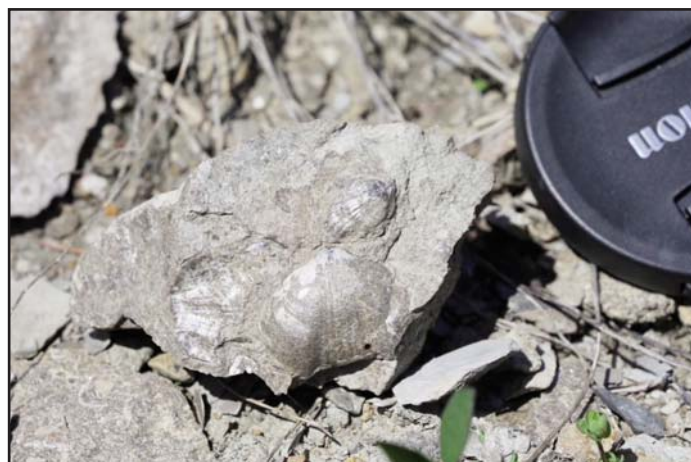
Brachiopod fossils at Hungry Hollow, Arkona, Ontario.