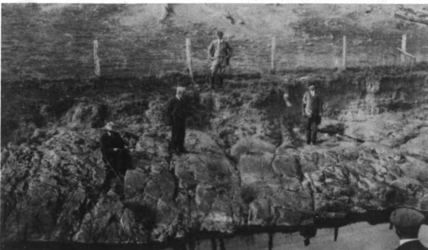
Figure 5 (upper) Outcrop of Late Paleozoic Dwyka Tillite, South Africa, with W.M. Davies, the geographer, 1905.