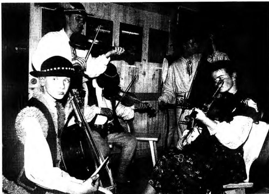
3. Musicians inside the “Culture House” on the Poronin festival grounds.