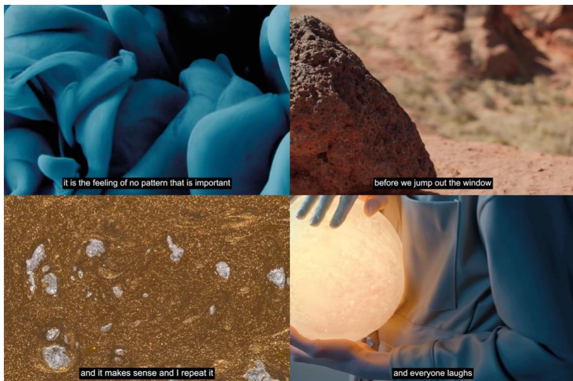
“patterns, rocks, gold, planets,” collage created for select important things (2022). Jane Frances Dunlop.