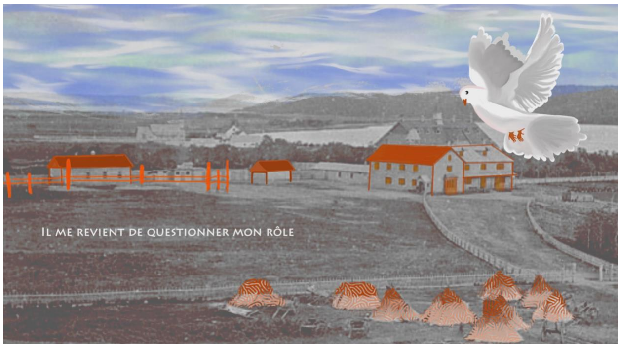
Video still from Honneur, la vérité, réconcilier, pour l'avenir, récit collectif , Gather Town. Original artwork by Gaëlle Issa, lyrics by Charlène Auré. Full video with original music by Gabriel Démosthène.

The final stage of our work took place in Gather Town. Our main concern was to create a warm and welcoming environment—a safe space where people can share their feelings, ideas, and get involved in our extremely personal interpretation. The platform fulfilled this desire for us. We created a simple, peaceful space, divided into a variety of small colourful areas with plants and poufs, in which one could reflect alone or meet with others. Arrows were also used to indicate a path to access all the visuals such as a couple of documentary images, and other visuals illustrated by my teammate.