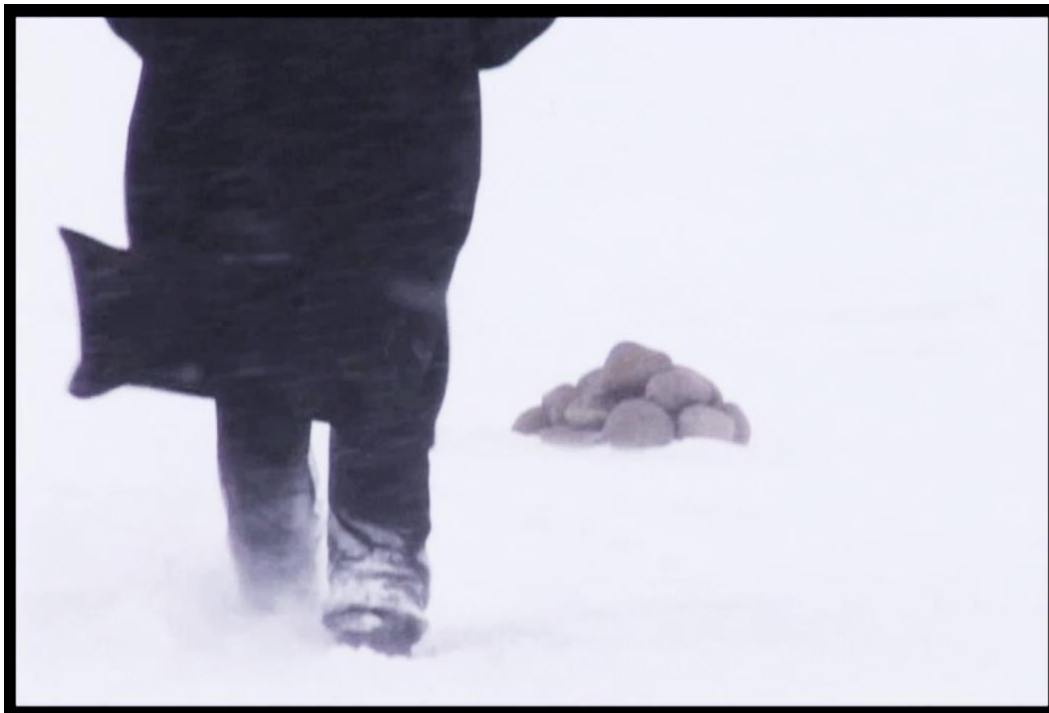
Leah Decter, Imprint (performance documentation) (2006). Videographer: Erika MacPherson.

The rectangle I pace traces my presence and labour and references the colonial process of reworking Indigenous land into property through imperial cartography, the staking of claim, and logics of possession. Scottish anthropologist Tim Ingold characterizes such delineations as “lines of occupation” inscribed by imperial powers “across what appears to be in their eyes . . . a blank surface” (2016, 81). Demarcations onto the land, envisioned as empty through the conceit of terra nullius, remain charted with purpose in settler states. These ideologically driven mappings are embedded within the terrain of Western culture as it has been imposed in these lands from the onset