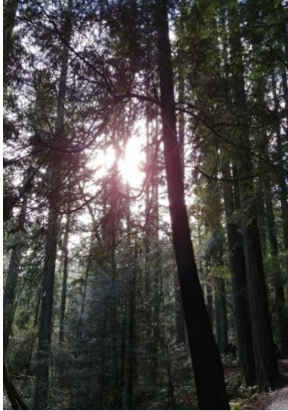
Sun peeking through cedar trees, Whatcom Falls Park, February 17, 2021.