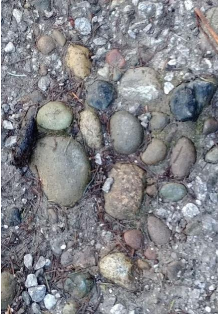
Close-up of the constellation of rocks, stones, and pine needles on the path into Whatcom Falls Park, February 17, 2021.