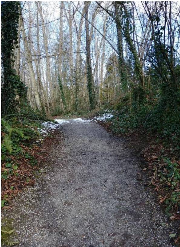
The path into Whatcom Falls Park, February 17, 2021.

1. Impermanence: “Guesting is by nature impermanent,” writes Hughes. “Guests are not resident owners. They come to a place already occupied, already owned. They come to a specific place, a place that existed prior to their arrival and prior to their needs as guests” (Hughes 2019, E-24). Escaping the roar of traffic on Lakeway Drive, the main road intersecting with the south entrance to the park, I begin my ascent up the gravel path to Whatcom Falls Park. I begin to tune my ear to the sound of the wind in the trees and the crunch of gravel under my feet as I walk in a moderate but steady rhythm. I think about the rocks that have occupied the earth for billions of years. They precede me and will proceed after me. I am impermanent, a mere snapshot in their time.