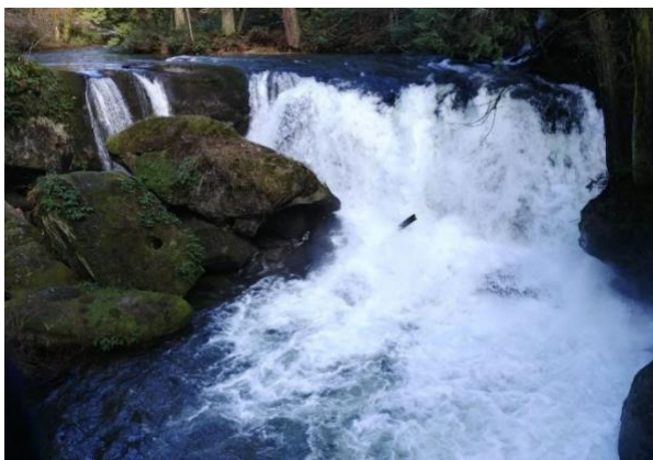
The falls, Whatcom Falls Park, February 17, 2021.