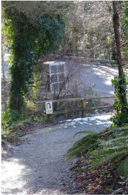
Park exit to Lakeway Drive, Bellingham, February 17, 2021.