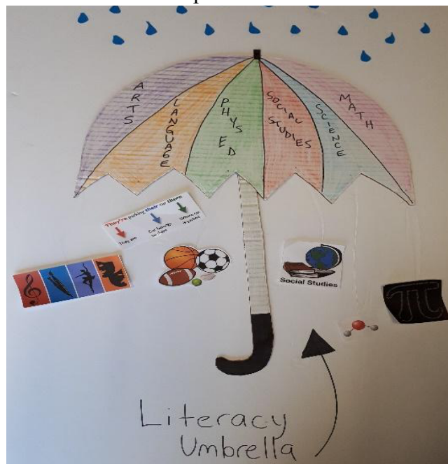
Figure 1. Literacy Umbrella from Participant Oliver’s Visual Journal