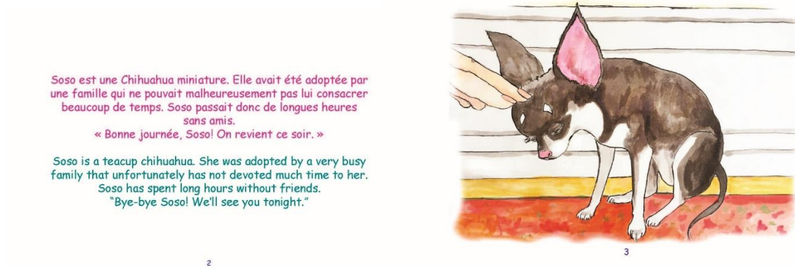
Figure 2. Passage of Enchantée!/Pleased to meet you! (Brunelle & Tondino, 2017)

The translated book we used is entitled Enchantée! Pleased to Meet You! (Brunelle & Tondino, 2017), and it uses a style that includes the same information in both French and English. On the left page, the French text is written in pink on the upper part, and the same passage is written in English in blue at the bottom of the page, with an accompanying image on the right page. It tells the story of how Soso, a teacup Chihuahua, meets Frieda, a mouse, and how they become friends.