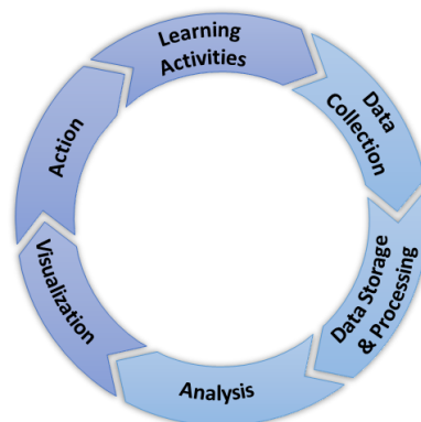
Figure 1. The learning analytics cycle.