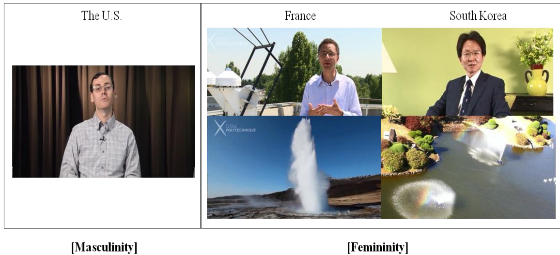
Figure 3. Examples of masculinity and femininity.