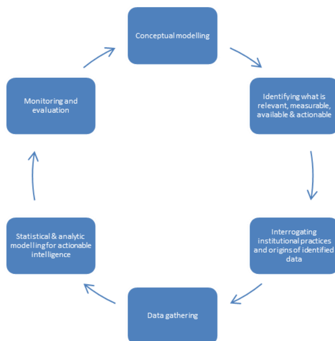
Figure 2. The main elements and process of managing student success at Unisa (Subotzky & Prinsloo, 2011).

The modelling process set out by Subotzky and Prinsloo (2011) provides a useful, if broad, overview of the process to follow when developing a process focussed on developing a data-based model of student success. The model, however, requires adjustment in light of the concerns raised by Morozov (2013) and others. Specifically, the cyclical nature of the modelling process requires greater emphasis and the addition of a consultation process following the identification of what is relevant, measurable, available and actionable (Subotzky & Prinsloo, 2011). The additional process would focus on a consultative interrogation of the underlying assumptions and institutional practices that inform the method of data collection. Additionally the consultative process would have to address the ethics of data ownership and the application of the data outcomes to regulate behavior as proposed by Danaher (2014) and Morozov (2013).