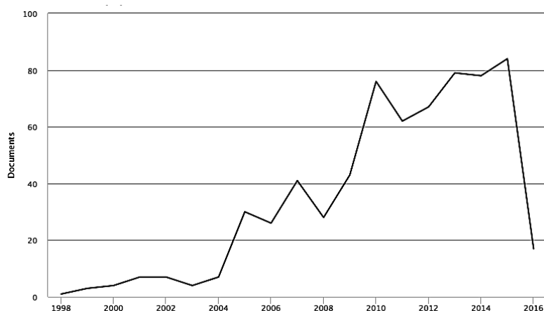
Figure 1. First selection of documents by year.

The last filtering was carried out through an abstracting process that allowed reducing the document set to a final group of 100 items, ready for further in-depth reading as shown in table 1.