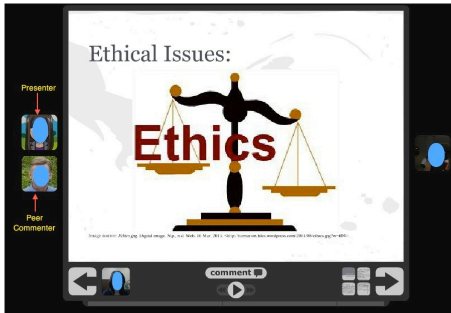
Figure 1. An example of role-playing peer feedback activity on VoiceThread.