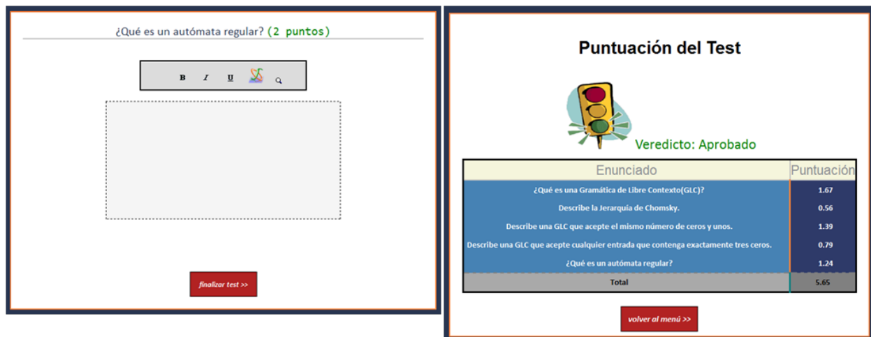
Figure 3. Question and text editor with MathEdit (a) and mark of the test once it is finished (b).

In order to evaluate themselves, students are shown a list of alphabetically ordered subjects in which they can realise the evaluation by choosing a subject and selecting the test they wish to start with and the difficulty level. The statement of each question is presented to the students together with their corresponding mark. The students must answer within a text editor, where they can insert formulas thanks to a JavaScript plug-in called MathEdit (Su et al., 2006), as seen in Figure 3a. Once the answer has been written and the test is finished, the system provides a score to the student together with the obtained marks in each of the questions (see Figure 3b). Likewise, the students can check, for each question, the answers they wrote as well as the reference questions written by the teacher.