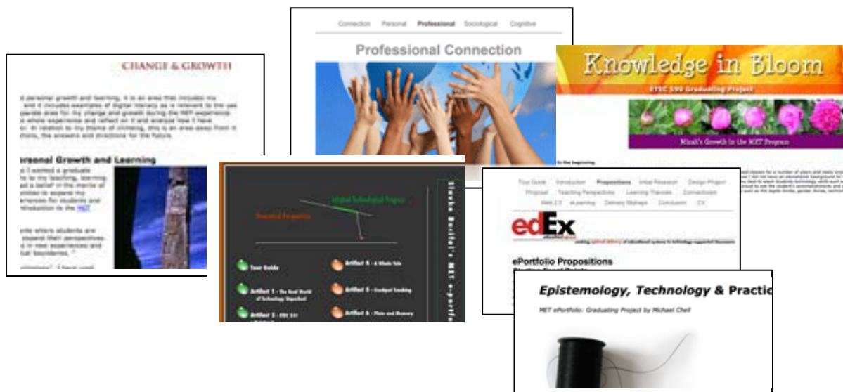
Figure 2. A collage of ePortfolios from Summer 2007

A different way in which the metaphors and hyperlinks were connected was demonstrated in DB’s ePortfolio. He used visual tools (and the sidebar) to introduce each section. All those visuals and tools linked well to the overarching metaphor of learning as making choices of the appropriate tools within a workshop.