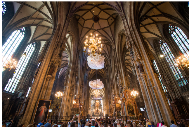
Picture 4: St. Stephen's Cathedral Vienna

awfulness or overpoweringness would be examples. According to Otto, religious traditions use different “means of expression” (ibid.: 79); among them, and especially important, is architecture. In his book he describes a whole range of constructive elements that are qualified to induce the experience of the “numinous,” such as the contrast between the giant and the tiny, which can be interpreted as an alteration of the contrast between the universe (gigantic) and the human being (tiny) – a central motif in almost any religion. With regard to architecture, this contrast can be realized vertically as well as horizontally.