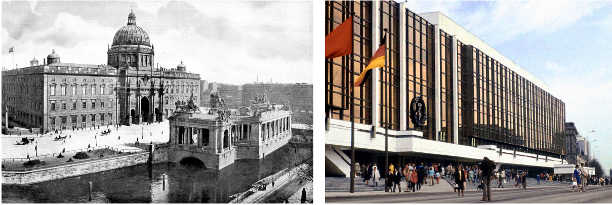
Picture 2a: Prussian City Palace, West facade with classicist cupola and cross on the top, around 1900