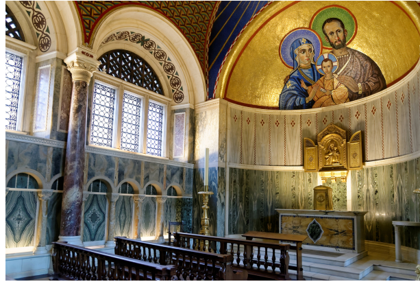
Picture 3: The Chapel of St. Joseph in Westminster Cathedral

“After ten minutes in the cathedral, a range of ideas that would have been inconceivable outside began to assume an air of reasonableness. Under the influence of the marble, the mosaics, the darkness and the incense, it seemed entirely probable that Jesus was the son of God and had walked across the Sea of Galilee. In the presence of alabaster statues of the Virgin Mary set against rhythms of red, green and blue marble, it was no longer surprising to think that an angel might at any moment choose to descend through the layers of dense London cumulus, enter through a Window in the nave, blow a golden trumpet and make an announcement in Latin about a forthcoming celestial event. Concepts that would have sounded demented forty metres away, [...] [that is, outside the cathedral] had succeeded – through a work of architecture – in acquiring supreme significance and majesty” (de Botton 2006: 109-111).