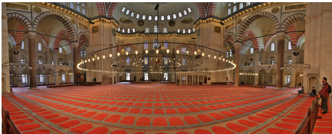
Picture 5: Süleymaniye Mosque Istanbul

While Western architecture imposes on us the impression that we are tiny creatures through creating breathtaking vertical spaces – think of St. Stephen's cathedral in Vienna (see picture 4) for example – Oriental architecture is more based on the magical virtue of vastness and emptiness as one can see